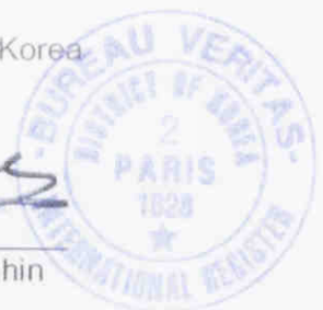
HeeChang Shin Surveyor