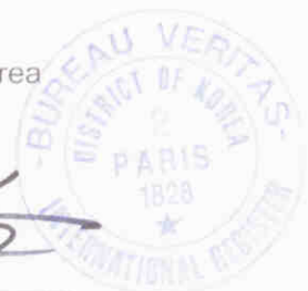
HeeChang Shin Surveyor