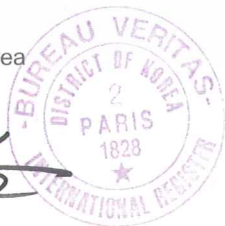
HeeChang Shin Surveyor